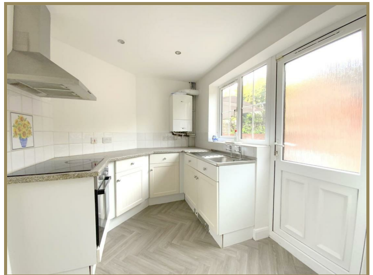
1 Fern Mews Market Place, Tetney, DN36 5NN £150,000